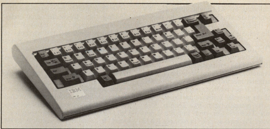
The new IBM PCjr keyboard features 62 full-stroke typewriter style keys in standard QWERTY layout. The built-in infrared serial link has a range of 20 feet.

• Keyboard interface circuitry for both infrared and direct wire links