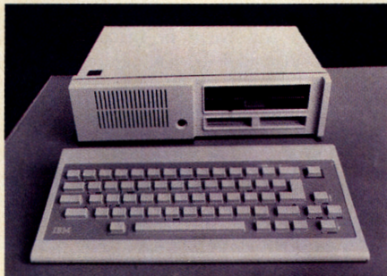
PCjr consists of a keyboard and a system unit. The infrared "eye" is to the left of the disk drive and two cartridge slots on the system unit.