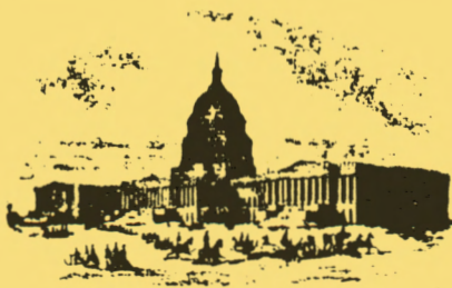
THE CAPITOL STORE

BACK ISSUES AVAILABLE - If you would like to "catch up" on back issues of the Eugene PCjr Club Newsletter, just drop us a line. The "masters" are in the files, at least as far back as May 1986. We'd like to get reimbursed for the Xeroxing and postage, so the cost will be about .90 each. We can Xerox copies of earlier ones, but as they are not the "masters," the quality isn't as good. Let us know which ones you need.