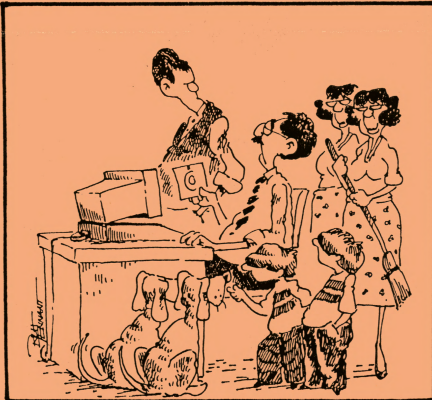
THE OFFICIAL XTREE MS-DOS & HARD DISK COMPANION